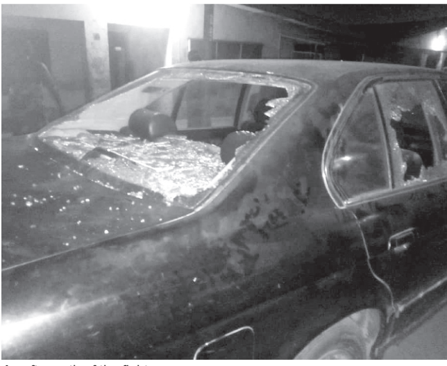
An aftermath of the fight